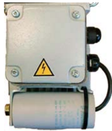
100-120 Volt standard pump original plastic-cased capacitor