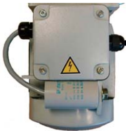
200-240 Volt standard pump original plastic-cased capacitor